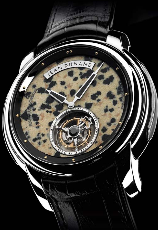
The mottled black, brown and cream colors of Dalmatian jasper dial give the Tourbillon Orbital a dramatic look.

Both a traditional tourbillon and a carousel tourbillon, it orbits around the circumference of the dial as the balance and escapement rotate on their own axis via a prestigious flying tourbillon mechanism. Returning the tourbillon complication to its roots as a precision-enhancing device, timing tests have proven Jean Dunand's combination of a carousel and traditional tourbillon significantly improves the watch's timekeeping accuracy.