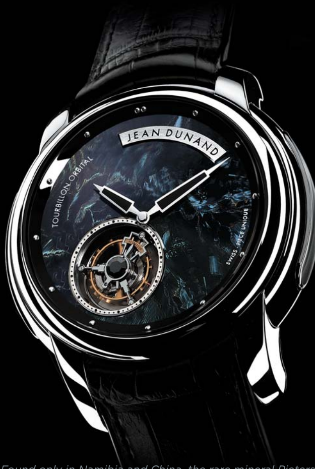
Found only in Namibia and China, the rare mineral Pietersite is used by Jean Dunand for the Tourbillon Orbital's dial.

The 2008 edition of the Tourbillon Orbital is available with exquisite new dials made of rare gemstones and fossils, and dials created with Jean Dunand's signature Art Deco style. Choices include rare stones such as Burma jade, Pietersite, fossilized coral, and sapphire, all of which must be large enough to be formed into 30mm diameter dials. The new Art Deco dials are made of materials such as champlevé enamel or Chinese lacquer and are the result of more than two years of research and development. The results have stunned connoisseurs with their amazing beauty and unparalleled quality. "Differentiation is a benchmark; this leads us to research artistic fields or new techniques with, possibly, a novel approach to century-old traditions. This requires years of work and important material investments just to produce a few dials. It is a never-ending quest for perfection," Oulevay says.